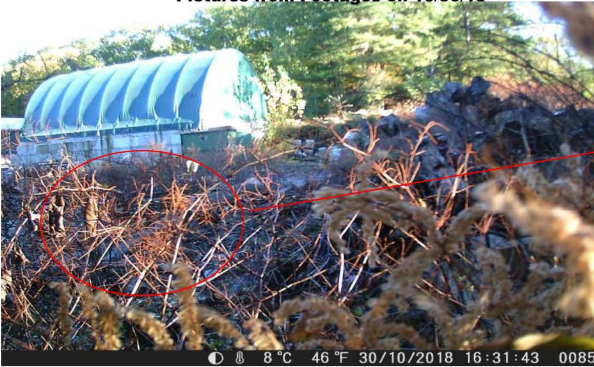
Exhibit 3 (continued) Pictures from Footages on 10/30/18

Missing logs that were present in the above pictures on page 7.