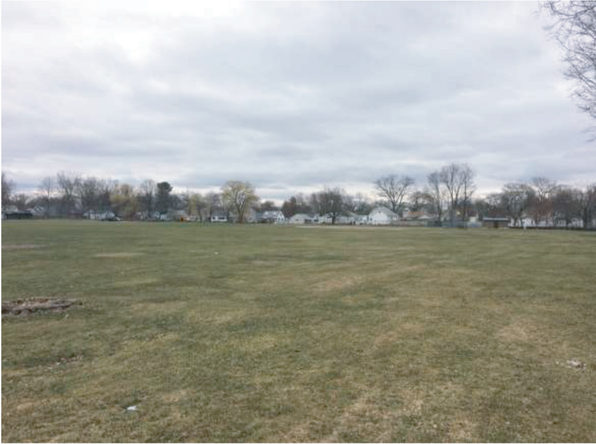
Additional Field Photo